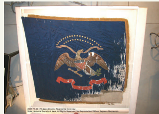
2001.71.42, 17th Iowa Infantry, Regimental, Capitol Display, NE Case, 1st floor rotunda, Oct 15, 2009- Jan 15, 2010.

lic as they are finished. The IBFP can now keep that goal and the public can benefit.